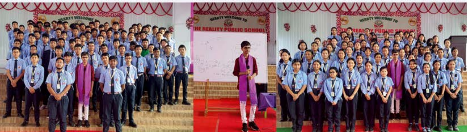
Students of Classes IX, X, XI & XII Interacting with Master Sarim Khan the 'Little Einstein of India'

Increasingly, technical universities and colleges are making it more challenging for the students to get admission. Students have the challenges not only to master the contents but also have to apply it experimentally through practice that involves a specialized approach. The school has provisions for coaching for IIT / Engineering and Medical Entrance Exams. Our students are sure to excel and get admission in Engineering and Medical Colleges in near future.